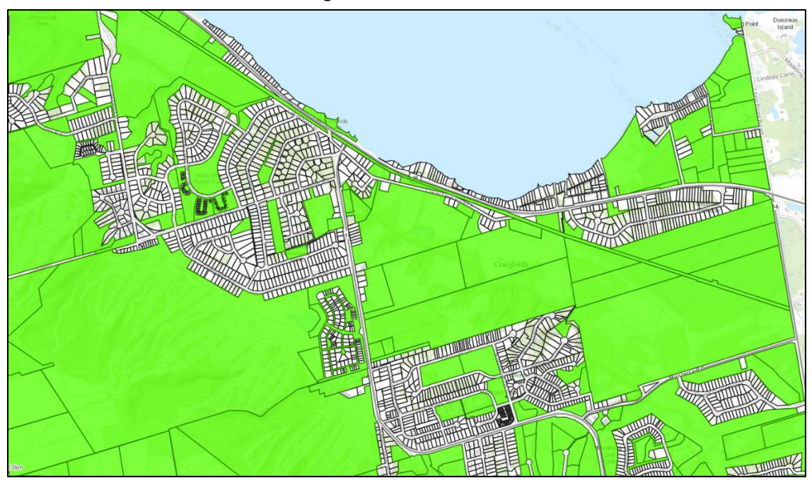
Figure 3: Properties within Village of Craigleith and surrounding areas which are minimum 0.5ha in size are shown in green.