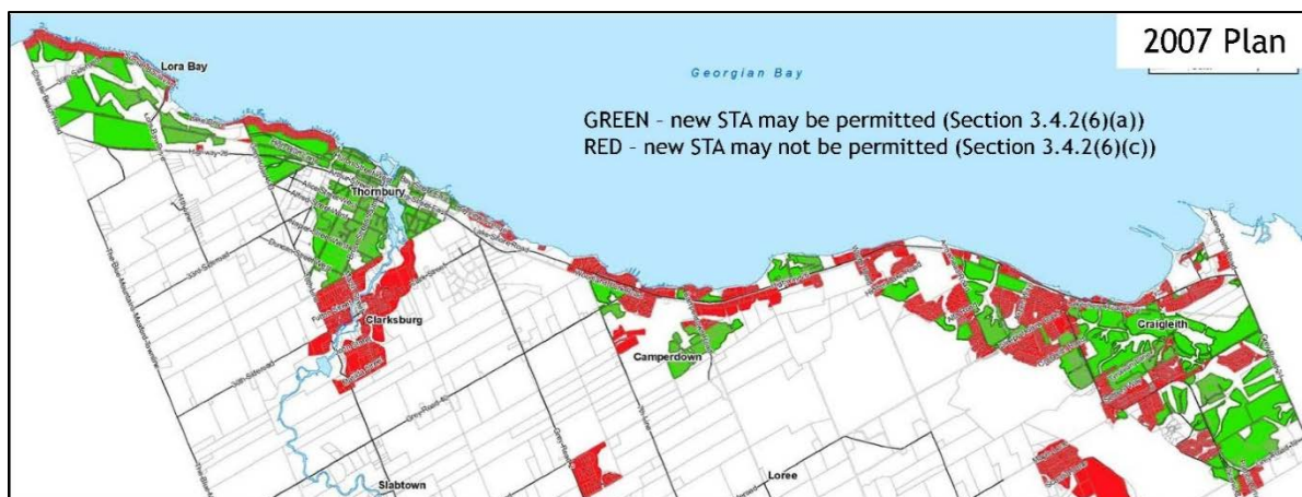
Figure 1: 2007 Official Plan Direction on locations for new STA uses.

In particular, Official Plan Amendment 11 created the policy direction that is now found under Section 3.4.2 of the 2007 Town of The Blue Mountains Official Plan. Numerous commercial accommodation types were identified including STA's, Bed and Breakfasts, Boarding or Rooming House, Tourist Cabin or Cottage, Hotel and Motels and Residential uses. OPA 11 then provided policy direction on where each of these accommodation uses can be located and how they should be regulated. New accommodation uses shall avoid disruption to adjacent residential uses through mitigation of potential impacts including noise control, waste management, setbacks, buffering, servicing and adequate on-site parking among other things. OPA 11 established requirements for additional Council approvals when a new STA is to be considered including Zoning By-law Amendment and Site Plan Approval to reduce any detrimental affects caused by the use of a dwelling as an STA. OPA 11 directs new STA uses to: those land use designations that permit a range of housing types; to provide mitigation measures in the form of zoning provisions and site works; and not be permitted in residential land use designations that restrict the use of land to only single detached dwellings. (OPA 11, Section 3.4.2(6)). Figure 1 below summarizes where new STA's are directed to and directed away from.